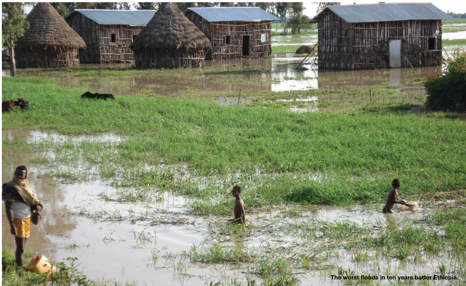
The worst floods in ten years batter Ethiopia.