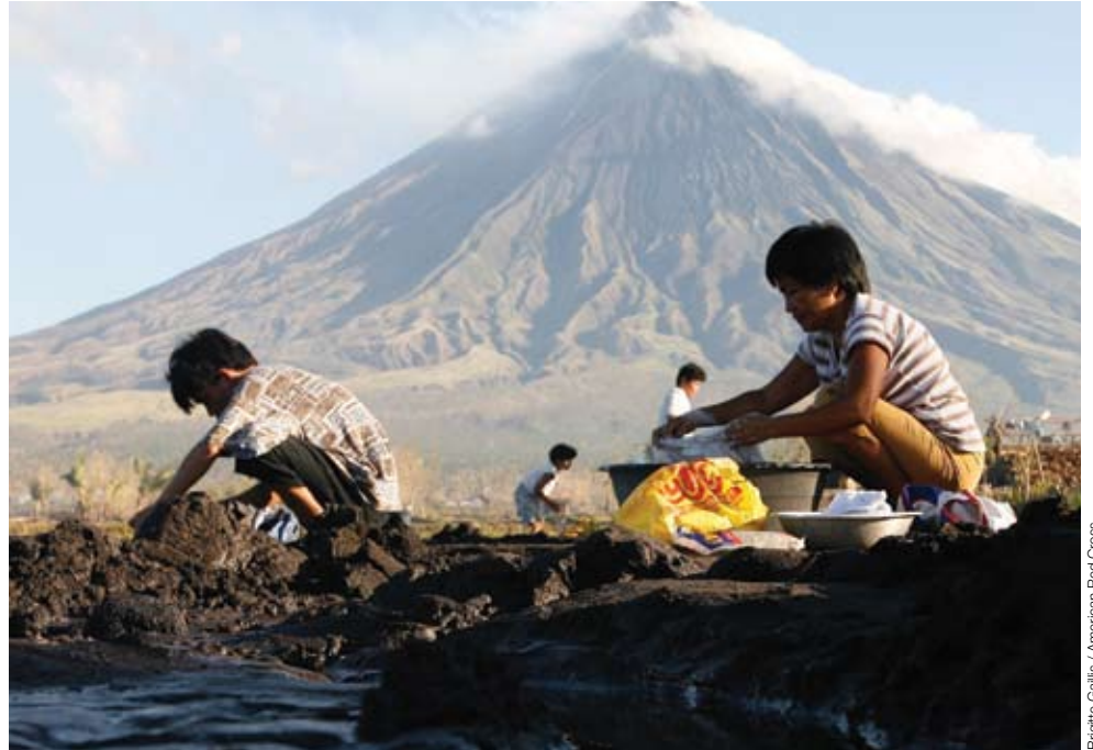
Children participate in disaster preparedness activities in the Philippines.