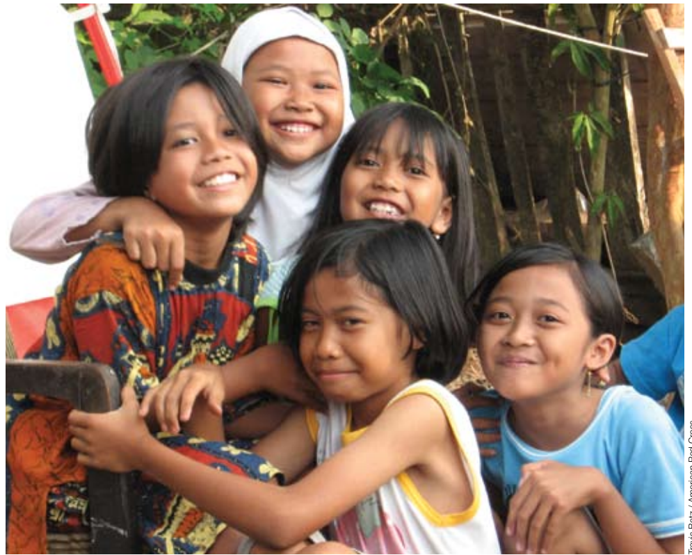
Indonesian children manage to smile following a traumatic earthquake in July.

The Movement's three components form an intricate support system. When needs exceed local capacity, national societies can offer their expertise to the International Federation, the ICRC and the national society requesting additional support. This allows other national societies, which often includes the American Red Cross, to assist those in need around the world. Coordination through the International Federation and/or the ICRC assists in determining the most advantageous support mechanisms. This unified response targets aid appropriately, avoids duplication of efforts and encourages collaboration. This results in needs-based programming, transparency in service delivery and adherence to international humanitarian standards. Movement coordination also